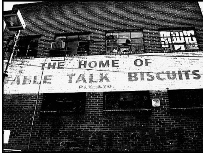
Prahran, Victoria